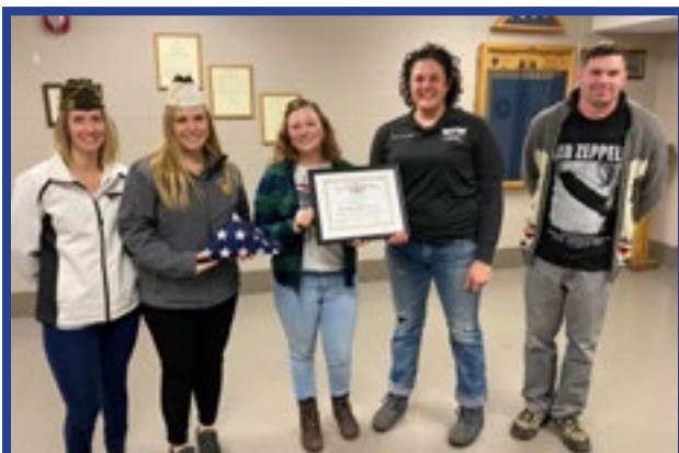
Post Officers present flag and certificate of Adopt-A-Unit to the commanding officers of the 1073rd Maintenance Co.